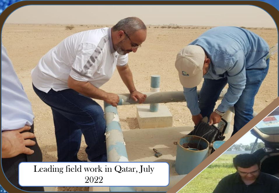
Leading field work in Qatar, July 2022