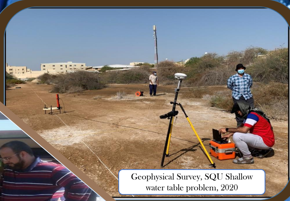
Geophysical Survey, SQU Shallow water table problem, 2020