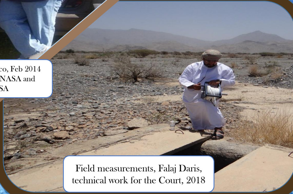
Field measurements, Falaj Daris, technical work for the Court, 2018