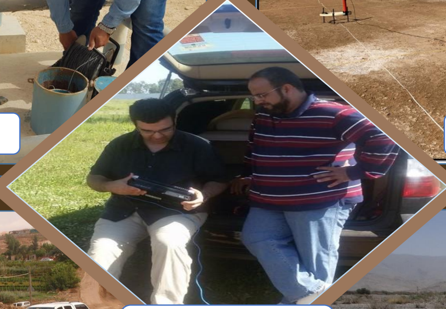
Field work in Morocco, Feb 2014 Collaboration with NASA and Caltech, USA